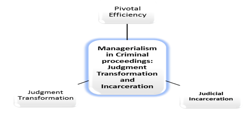
Figure (2): "Core category and research's grounded theory"

The result of data analysis is three main categories (pivotal efficiency, transformation of judgment, judicial incarceration) and one core category (managerialism in criminal proceedings: judgment transformation and imprisonment tendency of judges). Figure 2 illustrates the grounded theory of this paper.