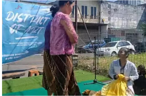
Figure 6. Bawang Merah and Bawang Putih Drama

All art activists in the subdistrict of Ringinanom have had a significant impact on their individual art groups. During the 'District of Art' event, Lampu Putih were able to perform their song in a highly captivating manner since the vocalist, violinist, bassist, guitarist, and drummer were able to perform at their best and sync well with one another. Karawitan players are also able to perform songs and accompany the buto and ganongan dances because to their excellent coordination. The dancers are also able to gracefully move their bodies to the karawitan music. The success of the staging of the drama scripts 'Naked Child' and 'Bawang Merah Bawang Putih' was also attributable to the performers' ability to perform their characters effectively, meticulously follow the director's instructions, and coordinate with other players on stage without compromising the plot.