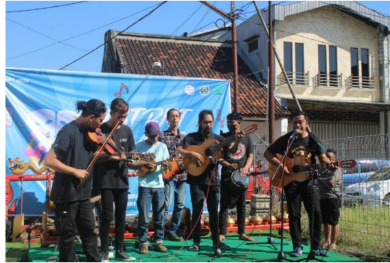
Figure 3. Lampu Putih Band