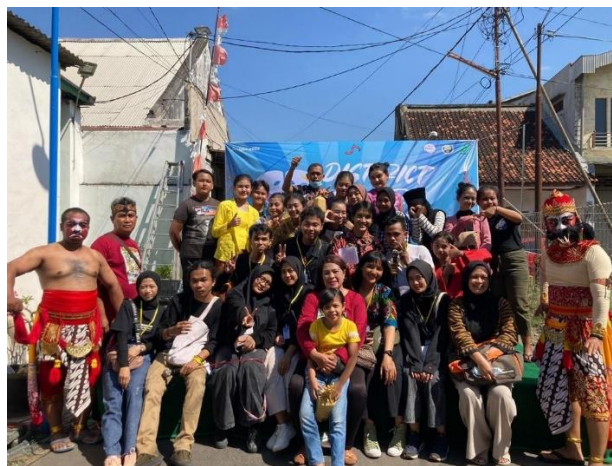
Figure 7. 'District of Art' Event

The primary need for a performance to be considered a show is an audience. What is observed and what is observed require communication as a mutually supportive factor. This contact may take place both directly and indirectly. How effectively the message can reach the audience will be revealed by the audience's reaction.