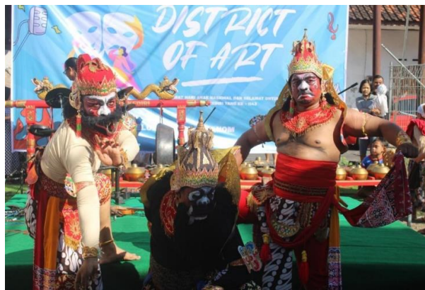
Figure 4. Buto Dance

Art organizations in Ringinanom Village are accustomed to putting on art performances with the aid of traditional administration. This is evidenced by the fact that every time they have an event, they do not have a normal committee composition, there is no event schedule, and artists and event attendees are subject to arbitrary changes. The Ringinanom sub-district is making efforts so that the arts organization in the sub-district can host an event that can be administered using modern management techniques. In this initiative, the Ringinanom urban village cooperated with the Malang State University implementation team to host an event called "District of Art." The collaboration between the implementation team and the Kediri city government consists of a number of initiatives designed to assist Ringinanom Village in enhancing its position as an Arts Village.