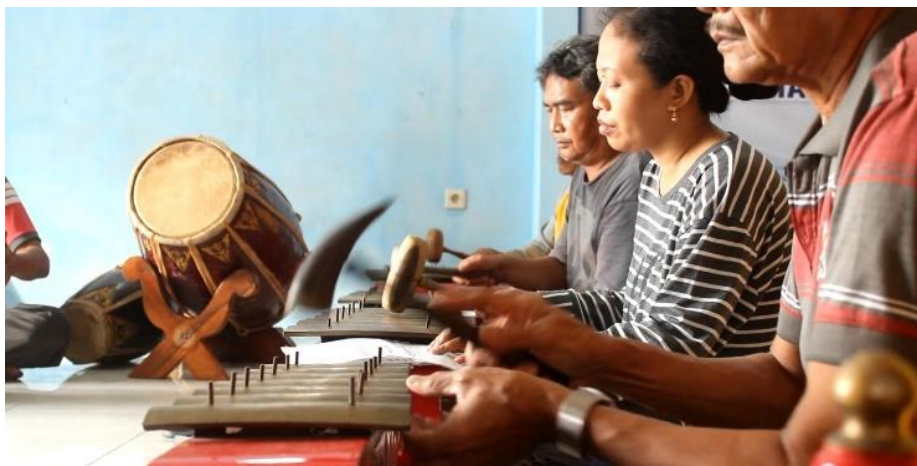
Figure 2. Anom Budoyo Karawitan Group

The subdistrict of Ringinanom is home to various art organizations that specialize in their particular professions. Some of these art groups are sponsored by LPMK (District Community Empowerment Institute) and POKDARWIS (Tourism Awareness Group), including the LPMK Band, which focuses on keroncong music, the Jaranan Art Satrio Anom Budoyo, which focuses on traditional jaranan dance, and the Karawitan Anom Budoyo, which focuses on art. traditional karawitan music. The White Lights Music Band, founded by the Karang Taruna group of Ringinanom Village, concentrates primarily on modern music. Lampu Putih even composed their own songs, with "Merah Putih Kediri" being one of their most frequently sung pop tunes. In addition to these art groups, there are a lot of art activists who do not have an art group by default because their membership is still very small; the ganongan dance, which once appeared at the 'District of Art' event, is one such example.