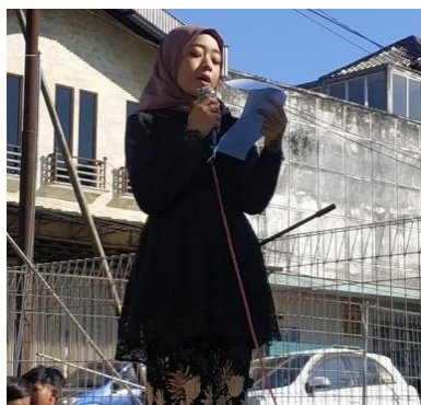
Figure 5. Poem Recitation of Ringinanom

Art organizations in Ringinanom Village are accustomed to putting on art performances with the aid of traditional administration. This is evidenced by the fact that every time they have an event, they do not have a normal committee composition, there is no event schedule, and artists and event attendees are subject to arbitrary changes. The Ringinanom sub-district is making efforts so that the arts organization in the sub-district can host an event that can be administered using modern management techniques. In this initiative, the Ringinanom urban village cooperated with the Malang State University implementation team to host an event called "District of Art." The collaboration between the implementation team and the Kediri city government consists of a number of initiatives designed to assist Ringinanom Village in enhancing its position as an Arts Village.