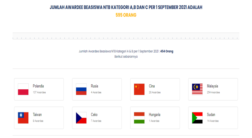
Figur 3 Data Awardee scholaship 2021 from LPP NTB

contributing in NTB but globally. So the Awardees are not required to return to their territory of origin. However, it is expected to have a global impact.