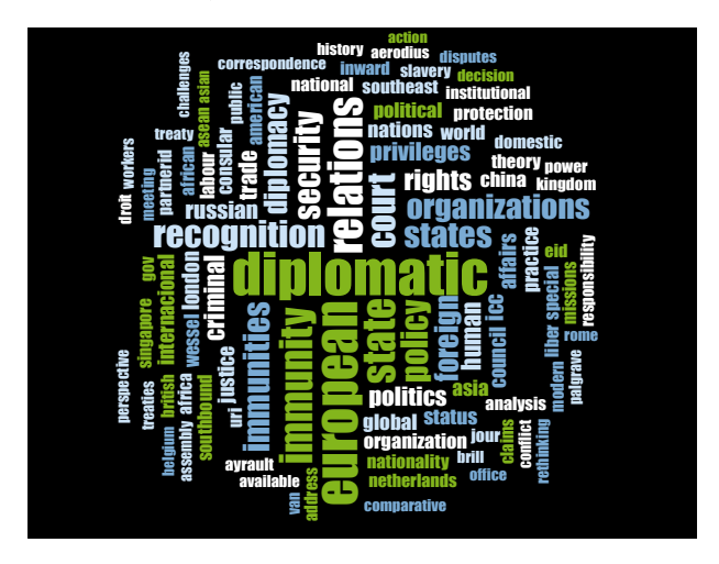
Figure. 2 Analysis of Diplomatic Immunity Problems

Article 1605(a)(1) provides for an exception to the right of immunity. When a foreign country has waived its immunity rights "either explicitly or implicitly, regardless of any withdrawal of calendar that may be intended by the foreign country, unless it is in accordance with the terms of the calendar." Like other exceptions to immunity, this provision operates to limit grants under statutes that call into question jurisdictionfederal (David,P. 2013: 34-41)