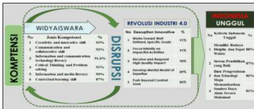
Figure 2. Percentage and Correlation Between Research Variables

In more detail, the percentage of research variables can be seen in the image below: